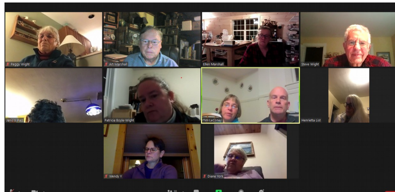
Church Council meeting via Zoom

Doesn't this describe what we've already been living through? These last 8-9 months, as we've been dealing with the pandemic and the separation from loved ones and church, has been a time of intense waiting and longing. We had a bit of a reprieve over the summer and early fall, when we could get out more and see one another in person safely using the right precautions. But, now, here we are right back where we started in the early spring. We are hunkering down for the winter months, waiting on the approval and distribution of a vaccine.